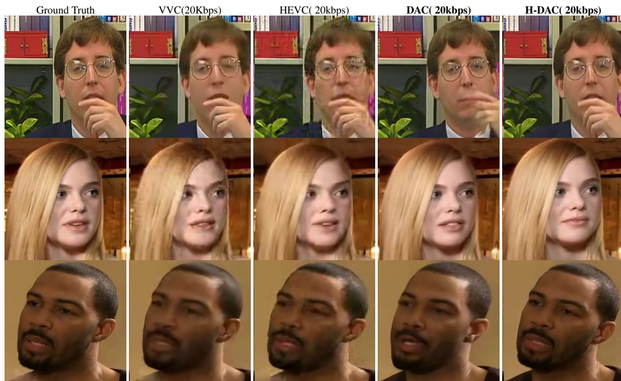
Fig. 2: Qualitative comparison of reconstructed images with our codec and state-of-the-art codecs at a similar bitrate. H-DAC significantly improves DAC in reproducing face expressions with good fidelity (e.g., the open mouth in the second row and the teeth in the third row), and is robust to non-face objects such as the hand in the first row. In addition, the synthesized images display lower distortion than HEVC and VVC.