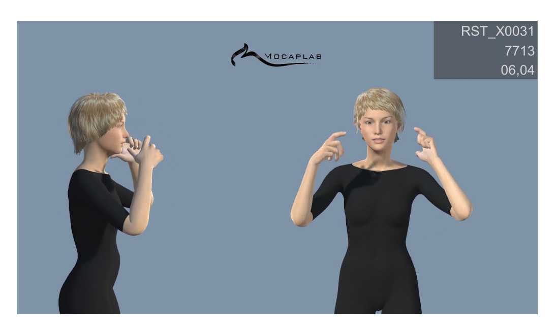
Figure 2: Avatar rendering

use. For each segment, three attributes have been specifically designed to help the generation process.