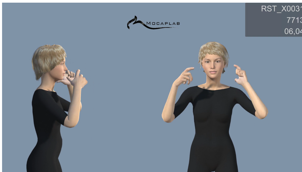
Figure 2: Avatar rendering

use. For each segment, three attributes have been specifically designed to help the generation process.