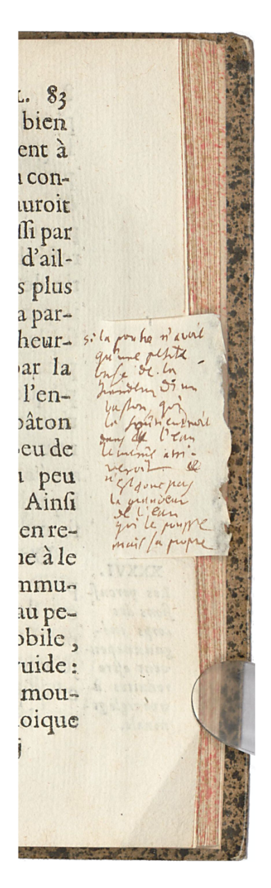
Figure 2—GWLB, LM 28, 83.

paper surface provided him with the space he needed for his commentary and to develop his own critical reflection.