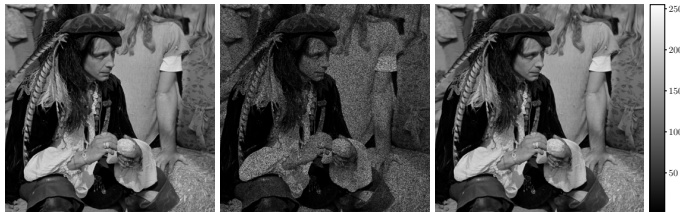
Fig. 3. Large scale inpainting experiment results. From left to right: ground truth, observations and MMSE estimate obtained with the proposed approach.

proposed in [13], at the price of a slightly lower SNR value. The 95% credibility intervals maps are displayed in the bottom row of Fig. 2. Both approaches show larger uncertainties on the contours, with lower uncertainty levels for the proposed approach. The overall estimation quality and lower per-iteration computing cost makes the proposed approach a highly compelling alternative to [13] for high dimensional problems.