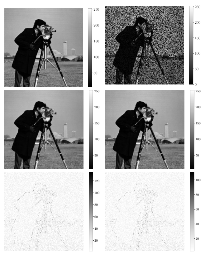
Fig. 2. Strong-scaling experiment results: ground truth and observations (first row), MMSE estimates (second row) and 95% credibility intervals (third row). For the rows 2 and 3, the results of the serial sampler [13] are reported on the left, those of the proposed approach on the right. Note that the credibility maps do not have the same scale to better highlight the distribution of uncertainties.

All the experiments have been conducted on the high performance computing grid of the University of Lille<sup>3</sup>. A single