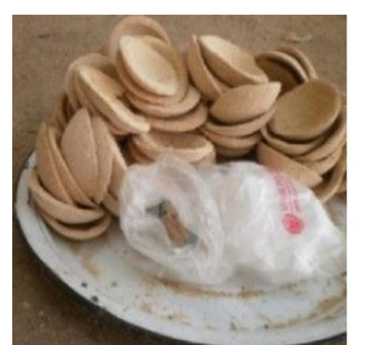
Figure 6: Biscuits of pulp of Z. mauritiana

Balanites aegyptiaca seed cake was used as animal feed (Figure 5).