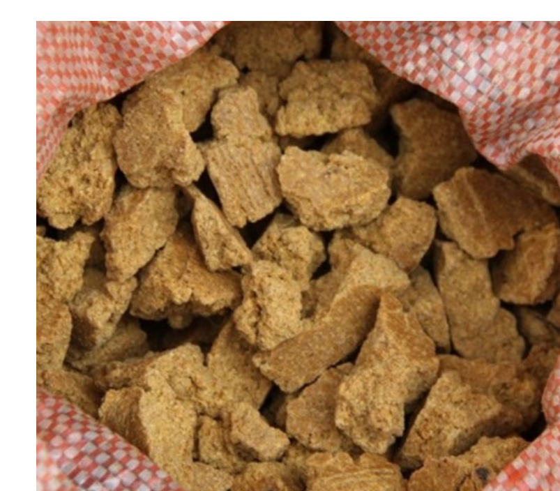
Figure 5: Balanites seed cake