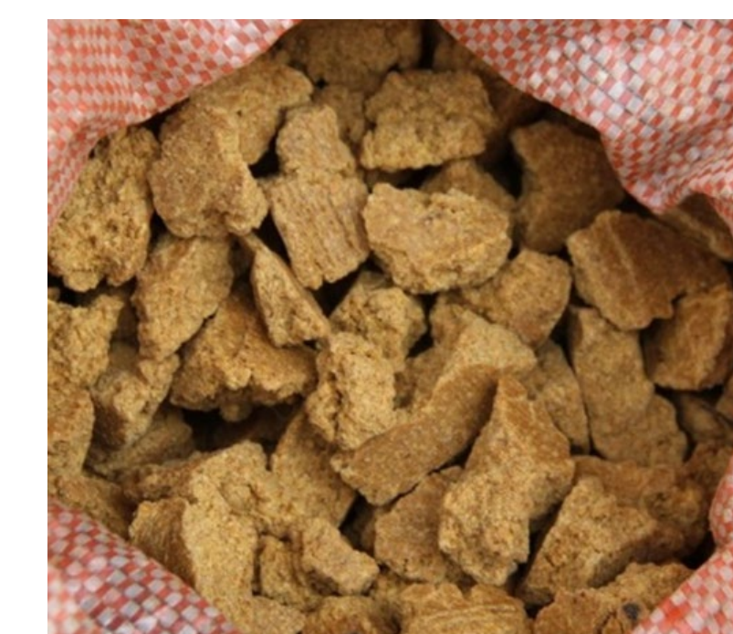
Figure 5: Balanites seed cake