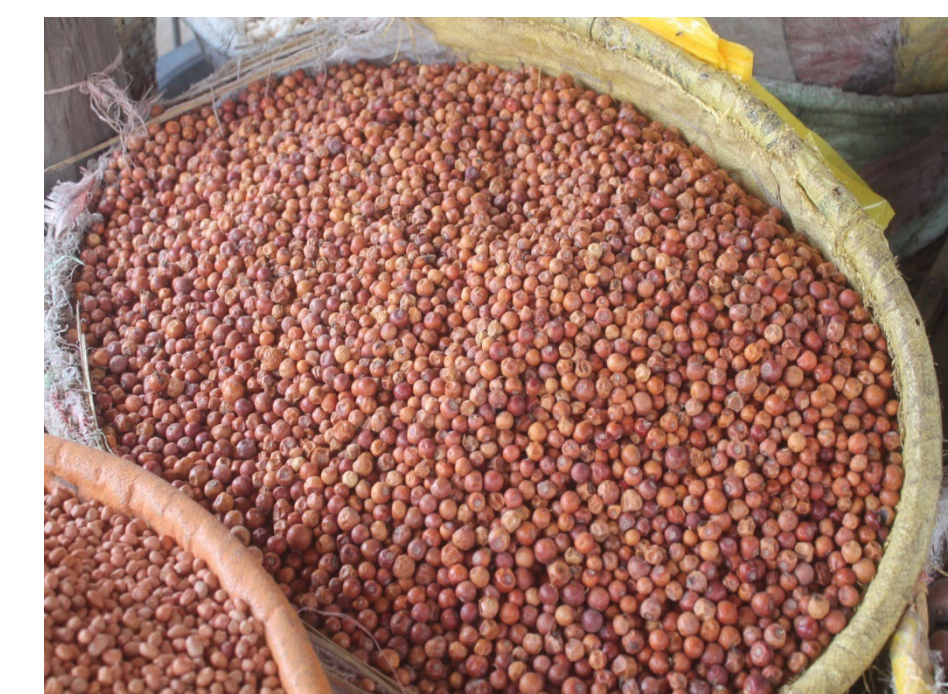
Figure 3: Marketing of fruits of Z. mauritiana by the Retailers in the Sandiga market (Dakar).

In cities, "banabanas" carried products to urban markets for sale to wholesalers, semi-wholesalers, retailers and consumers (Figure 3).