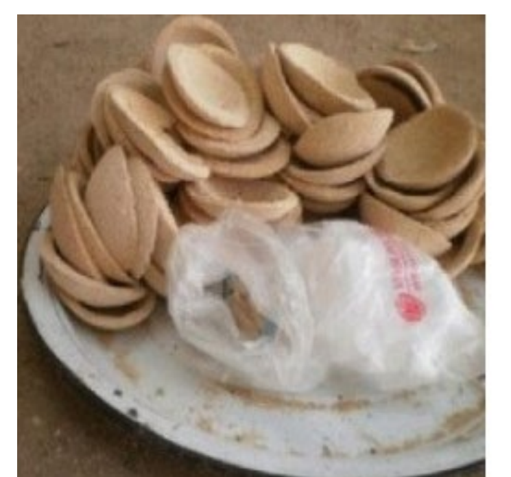
Figure 6: Biscuits of pulp of Z. mauritiana

Balanites aegyptiaca seed cake was used as animal feed (Figure 5).