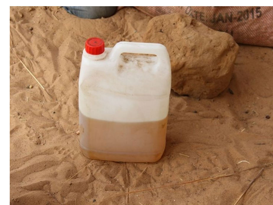
Figure 4: Balanites oil

The seeds of B. aegyptiaca are crushed (to grind stone or mortar). The obtained past is put into a pot and then is heated with a little water. After cooled, this past is pressed to obtain oil. This oil is sold in local markets by women (Figure 4).