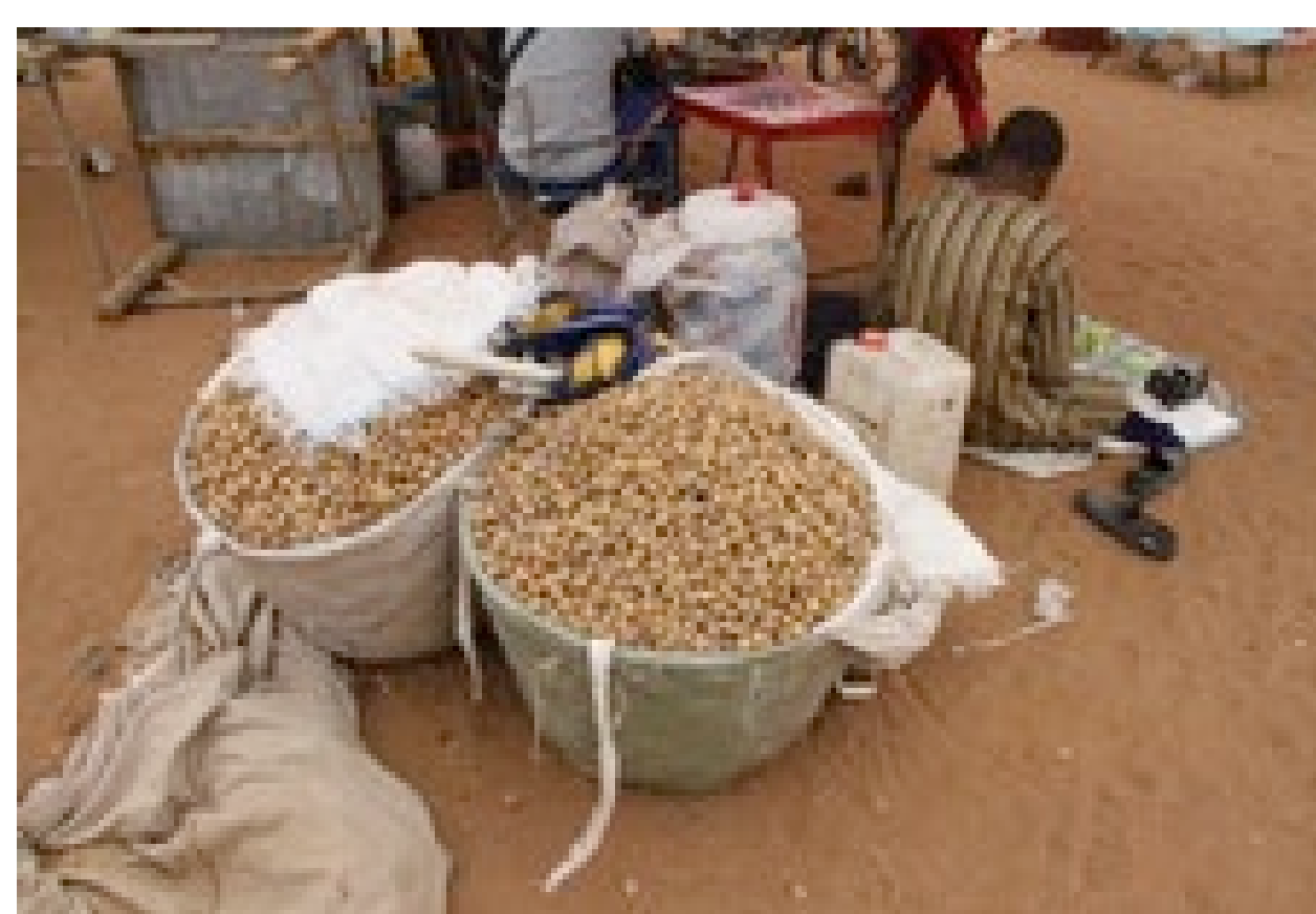
Figure 2: Exhibition of B. aegyptiaca fruits in the weekly market of Widou Thiengoly

In the Ferlo, the traders surveyed ("banabanas") bought products at the weekly markets in the various villages located at the survey sites (Figure 2).