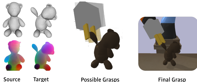
Fig. 1. Deformable object grasping by the proposed grasp transfer method. (left) Source and target meshes, and their functional maps. (middle) Transferred possible grasp configurations. (right) Executed best grasp.

† Extreme Robotics Laboratory, School of Metallurgy and Materials, University of Birmingham, Birmingham, United Kingdom. ‡ Sorbonne Université, CNRS UMR 7222, INSERM U1150, ISIR, F-75005, Paris, France. *Corresponding Author: CXM1029@student.bham.ac.uk