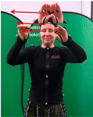
Figure 5: Example of R.1.1: movement repeated with attenuation and relocation, from MocapI : i0812, 00:34:17