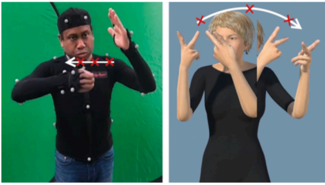
Figure 2: Two examples of motion repetition with different forms and meaning. Left side: from Mocap1 : i0611, 00:09:32 ; Right side: from Rosetta-LSF : RST X0047.demonstrateur1.mp4 00:03:60

We will apply the methodology to two different LSF video sets, which we present below.