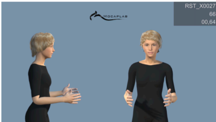
Figure 4: Screenshot of a video from Rosetta-LSF