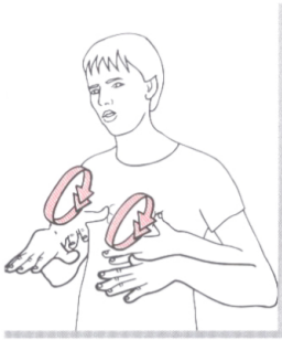
Figure 1: Form of production rule vêtement (IVT, 1997)