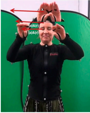
Figure 5: Example of R.1.1: movement repeated with attenuation and relocation, from MocapI : i0812, 00:34:17