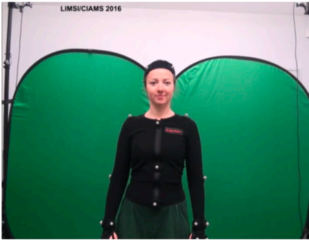
Figure 3: Screenshot of a video from Mocap1 corpus