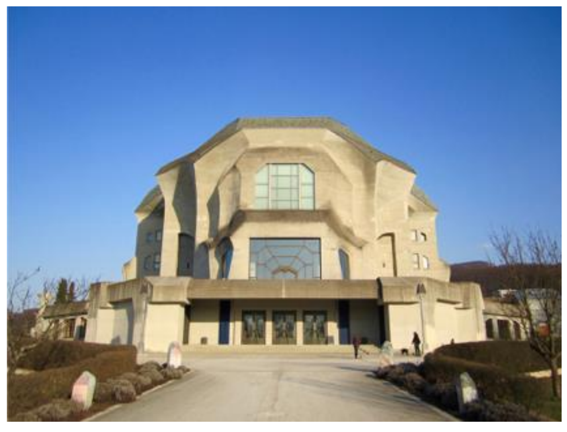
Fig. 8. Goetheanum exterior, front view.