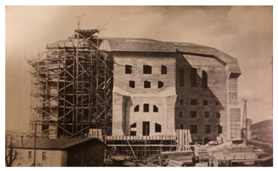
Fig. 3. The Goetheanum takes shape, south wall, in 1927 (detail) (source: Vorstand, 1927).

In January 1927, a local newspaper reported: "During the last few days, the roof over the two main parts of the new Goetheanum - the hall and the stage - has been finished, and a definite stage in the erection of this greatly-desired theatre has thus been reached. The entire building ... is of reinforced concrete, and is, of its kind and in its vast dimensions, one of the most interesting buildings recently erected in Switzerland ... the Solothurn Association of Architects and Engineers paid a visit to the site ... Under the guidance of the chief architect, Herr Aisenpreis, supported by Herr Ebbell of the Engineering Firm, Leuprecht and Ebbell of Basel ... the building was inspected from top to bottom ... About 15,000 cubic metres of concrete have been used, for which no less than 1,700 railway-trucks of sand and gravel, and about 450 trucks of cement were required ... The main girders over the great hall stretching over 30 metres ... made a great impression on all visitors ... the scaffolding was still here, and the low-lying terraces which will surround the structure were still missing ... One felt that in spite of its great size, the building would fit comparatively well into the landscape. Indeed, the many and severe misgivings which were expressed in this respect would seem to have been without foundation" (Zeitung, 1927).