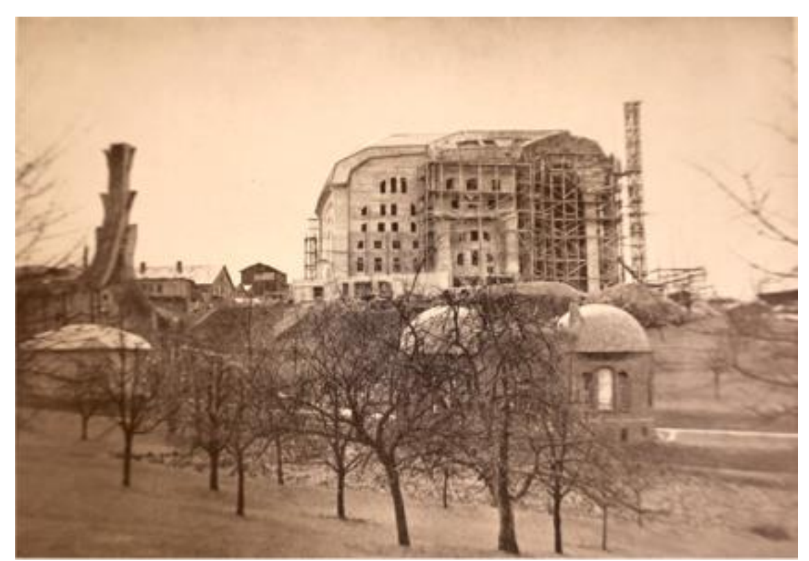
Fig. 5. Fund-raising image of the Goetheanum, rear view, with Glashaus in the foreground on the right, and Heizhaus on the left, in 1927 (detail).

Funds were still an issue, as they would be forever more: "Of the original appeal for about 1,950,000 francs for the erection of the building in its simplest structure, about half has been contributed in this last year. We could reach our goal if another 1,000,000 francs were given in 1927" (Vorstand, 1927) (Fig. 5).