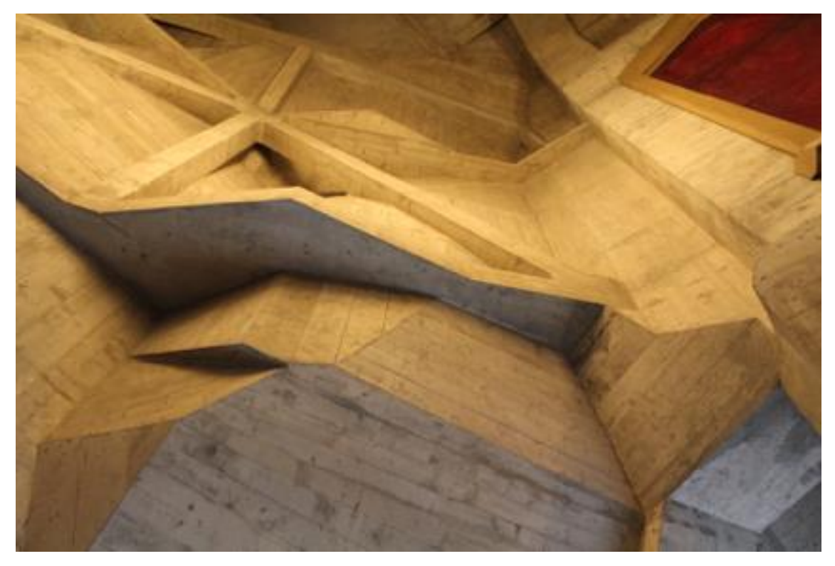
Fig. 7. Goetheanum interior, showing impressions on the concrete of the timber shuttering (formwork).