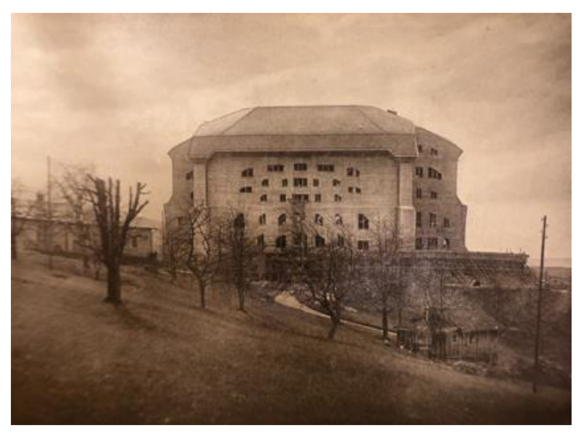
Fig. 4. Rear view of the Goetheanum in 1927 (detail).

Funds were still an issue, as they would be forever more: "Of the original appeal for about 1,950,000 francs for the erection of the building in its simplest structure, about half has been contributed in this last year. We could reach our goal if another 1,000,000 francs were given in 1927" (Vorstand, 1927) (Fig. 5).