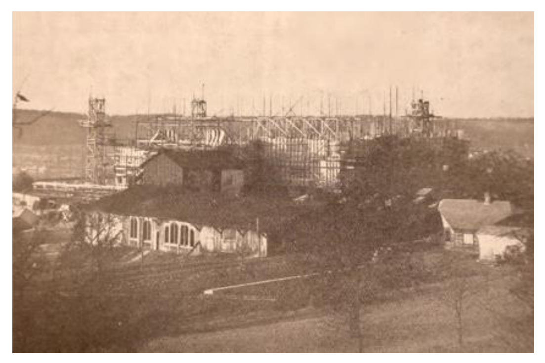
Fig. 1. Goetheanum scaffolded, with the Schreinerei in the foreground, in 1926 (detail) (source: Editor, 1926).

On February 1926, photographs in The Weekly News Sheet reveal the new Goetheanum well underway, with scaffolding all around, the stage in the course of construction, and a lecture hall and rehearsal room with floors, walls and roofed (Weekly News Sheet, 1926). Elisabeth Vreede could report "the second Goetheanum is growing up ... erected on the Foundation Stone of the old building" (Vreede, 1926, p.71). There was optimism: "only the Goetheanum can provide the citadel of the future" (Stuten, 1926, p.75). The actors were upbeat for completion: "Full of hope and anticipation, our eyes gaze every day at the growing building ... Until then our artistic work is being carried on in five buildings scattered over the country-side, limited by lack of space and many other hindrances... in the Schreinerei, few realise under what cramping difficulties these performances have had to be prepared" (Gümbel-Seiling, 1926) (Figs.1&2).