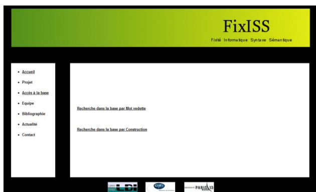
Figure 1: Database Home Page

Users can currently search the database using two types of search: (i) headword search (1811 out of the 5000 entries, ie. units that are salient in the adverbial phrase, with a specific taxonomic role) 4 and (ii) pattern search.