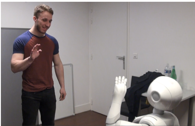
Fig. 1. Example of participant interacting with Pepper (picture taken with permission)

The interaction was structured in the form of a travel planning scenario for a hypothetical holiday within Europe, with Pepper acting as a travel agent (See Figure 1). In order to minimise voice recognition issues, the interaction was structured using both verbal cues and interacting with Pepper’s chest tablet. Pepper began the interaction by greeting the participant, introducing itself, and offering water placed on a nearby table. Participants had the option to either accept or refuse the water before proceeding with the interaction. Pepper then asked a series of dichotomous questions about participants travel preferences. Participants could indicate their choice by selecting the corresponding option on Pepper’s tablet. Pepper then asked the participant to describe more about themselves (self-disclosure) with the explanation that it was to personalise the travel recommendations. For each participant, Pepper generated two different travel locations (e.g., if the participant said they preferred cities and travelling by train, Pepper would suggest London or Amsterdam), and randomly expressed a preference for one. Participants could then either endorse or reject the recommendation by Pepper. The interaction was designed to last between 5-10 minutes. The full script for the interaction is available on GitHub. 1