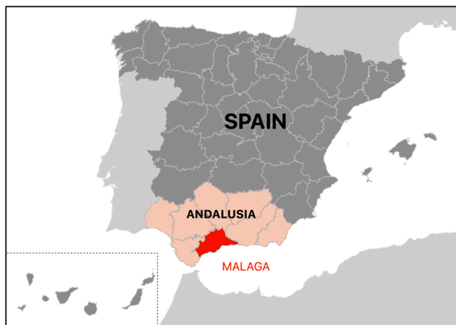
Fig. 2. Geographical location of the study site.

The diagnosis of the territory (context and stakeholder analysis) was conducted in order to address the main issues that hinder the development of aquaculture due to environmental, economic and social drivers. To do this, a first set of interviews was conducted with stakeholders between 2017 and 2019. All categories of stakeholder were questioned