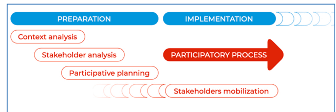
Fig. 3. Main steps to plan a participatory process (Lisode, 2019).

The diagnosis of the territory (context and stakeholder analysis) was conducted in order to address the main issues that hinder the development of aquaculture due to environmental, economic and social drivers. To do this, a first set of interviews was conducted with stakeholders between 2017 and 2019. All categories of stakeholder were questioned