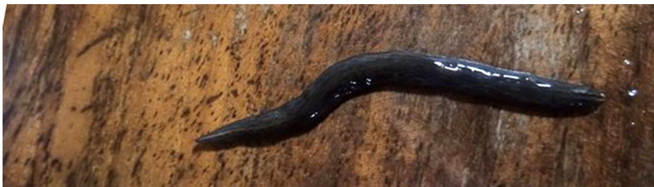
FIGURE 1. Photo of a live specimen of Obama nungara , taken in Petite France in the commune of Saint Paul, La Réunion. Photo by Régis Bretzner, taken 10 June 2021. The specimen is brown on the back, with darker brown striae, a reddish tip, and with a cream stripe running a short distance from the head towards the tail, but which soon disappears into the general colour of the back.

climatic suitability ( > 0.8 ). Based on the analysis of the model's response curves (Fourcade, 2021), it appears that the limiting factor was mainly the mean temperature of the warmest quarter (BIO 10 bioclimatic variable), coastal areas being too warm while high-altitude areas are too cold. It is noteworthy that all three localities where O. nungara specimens were found are inside zones of high suitability (Plaine des Grègues: 0.92; Petite France: 0.89; Gîte de la Bergerie: 0.73).