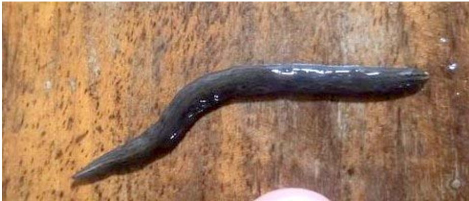
Figure 2. Photo of a live specimen of Obama nungara , taken in la Plaine des Grègues in the commune of Saint Joseph, La Réunion. taken 22 April 2021. The photo clearly shows the dark brown striae on the brownish coloured back, and the whitish under surface.

Figure 1. Photo of a live specimen of Obama nungara , taken in Petite France in the commune of Saint Paul, La Réunion. taken 10 June 2021. The specimen is brown on the back, with darker brown striae, a reddish tip, and with a cream stripe running a short distance from the head towards the tail, but which soon disappears into the general colour of the back.