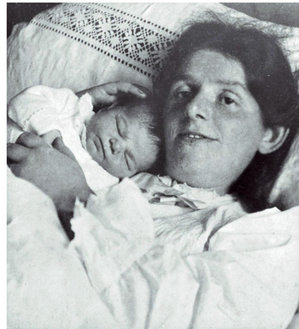
FIGURE 1 | Paula Becker (February 8, 1876–November 20, 1907), German painter, one of the most important representatives of early expressionism. Self-portrait and photography after giving birth.

The risk increases with the progression of pregnancy, peaks after delivery and normalizes 12 weeks later. Although two thirds of events occur before delivery and half during the third trimester, a quarter are diagnosed in the 3 weeks following delivery: postpartum is characterized by the highest daily incidence (1).