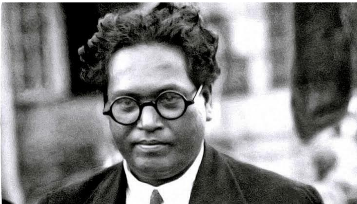
Ambedkar in Bombay, 1939

1939: On 29 January , he delivers a lecture titled Federation versus Freedom at the Gokhale Institute of Politics and Economics. It is published later in the year.