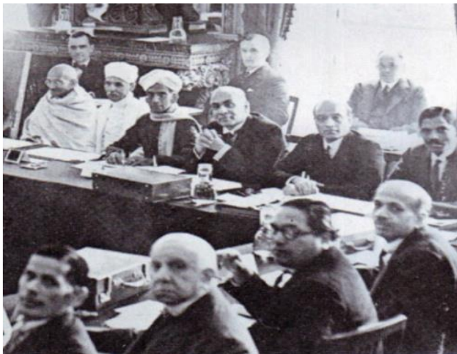
Ambedkar and Gandhi at the Second Round Conference in London (1931).

1931: Ambedkar and Gandhi attend the Second Round Table Conference held from 7 September- 1 December