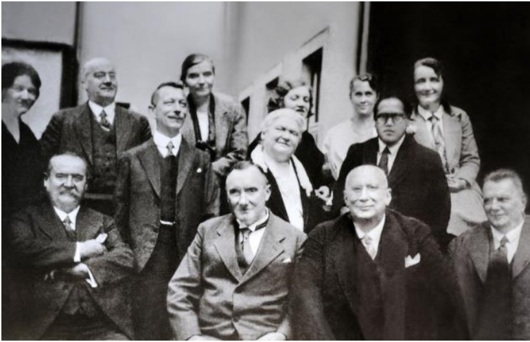
Ambedkar with his professors and friends at the London School of Economics

1917: He starts working on his thesis, but he is informed that the period of his scholarship is over. He returns to India after spending a year in London working on the thesis for the MSc (Economics). In July , he is appointed Military Secretary to the Gaikwad of Baroda; he had agreed to join the Baroda service as a condition of his scholarship 3 . In September , he travels to Baroda to take up his job.