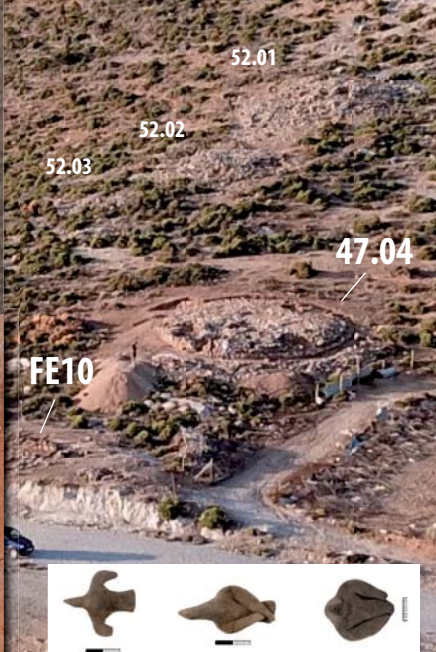
cessive stages of a bird taking flight