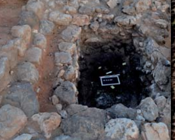
Fig.4: Pyre-Burial FE7 during excavation