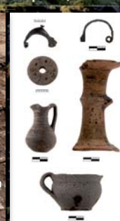
Fig.7: Cup, jug, lekythos neck, fibulae and spindle whorl from FE10