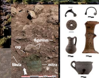
Fig.6: Objects and cremation residue deposited in FE10