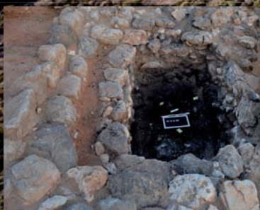
Fig.4: Pyre-Burial FE7 during excavation