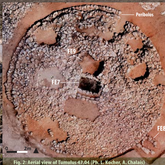
Fig. 2: Aerial view of Tumulus 47.04