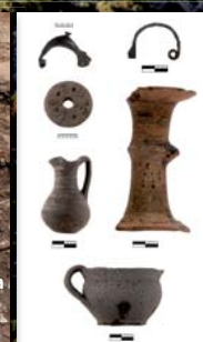
Fig.7: Cup, jug, lekythos neck, fibulae and spindle whorl from FE10