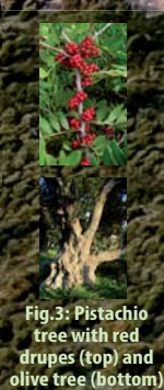
Fig.3: Pistachio tree with red drupes (top) and olive tree (bottom)