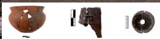
Fig.5: Cup, ivory plaque and clay bead deliberately fragmented during cremation in Pyre-burial FE7

Under the sandstone ashlar block that marked the center of the tumulus, excavations revealed the most ancient structure (ca 750 BCE): the primary pyre-burial of an adult (Fig.4). Among the funerary offerings it yielded, a cup, an ivory plaque and a clay bead present evidence for intentional breakage during the cremation (Fig.5). In particular, the burned fragments of the cup come from the pit itself, while the unburned ones were placed on top of the side wall of the pit. The presence of some intact twigs in the cremation residue indicates that the combustion was partial, suggesting that the pyre partly collapsed, stopping the combustion on both sides at the bottom of the pit. The distribution of the human remains suggests that the residues were not mixed during or after the combustion. After the cremation, the pyre was sealed and the pit was filled in with a mixture of stones and a dry sandy soil up to the top of the stepped installation for the pyre.