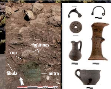
Fig.6: Objects and cremation residue deposited in FE10