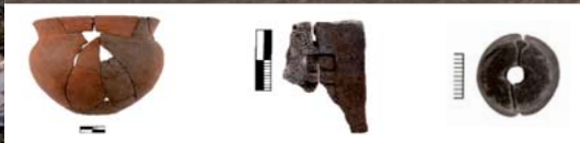
Fig.5: Cup, ivory plaque and clay bead deliberately fragmented during cremation in Pyre-burial FE7 (Ph. Ch. Papanikolopoulos)

Under the sandstone ashlar block that marked the center of the tumulus, excavations revealed the most ancient structure (ca 750 BCE): the primary pyre-burial of an adult (Fig.4). Among the funerary offerings it yielded, a cup, an ivory plaque and a clay bead present evidence for intentional breakage during the cremation (Fig.5). In particular, the burned fragments of the cup come from the pit itself, while the unburned ones were placed on top of the side wall of the pit. The presence of some intact twigs in the cremation residue indicates that the combustion was partial, suggesting that the pyre partly collapsed, stopping the combustion on both sides at the bottom of the pit. The distribution of the human remains suggests that the residues were not mixed during or after the combustion. After the cremation, the pyre was sealed and the pit was filled in with a mixture of stones and a dry sandy soil up to the top of the stepped installation for the pyre.