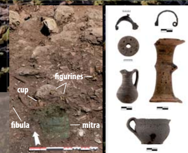
Fig.6: Objects and cremation residue deposited in FE10