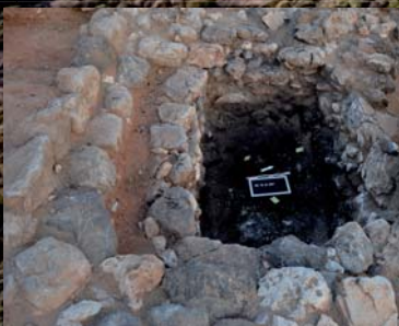
Fig.4: Pyre-Burial FE7 during excavation