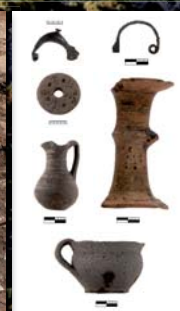
Fig.7: Cup, jug, lekythos neck, fibulae and spindle whorl from FE10