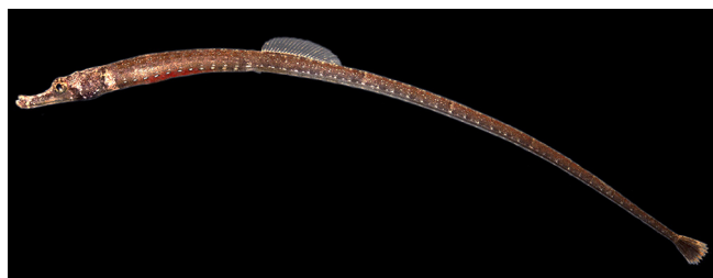
Figure 2. – Hippichthys albomaculosus, MNHN-IC-2022-0001, tag RTNC-371, female, 48.85 mm SL, from Népia River, New Caledonia.