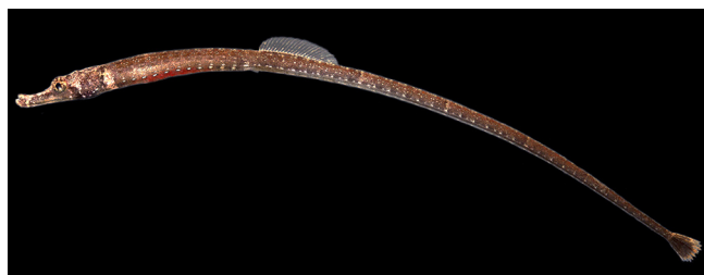
Figure 2. – Hippichthys albomaculosus, MNHN-IC-2022-0001, tag RTNC-371, female, 48.85 mm SL, from Népia River, New Caledonia.