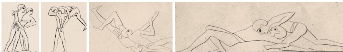
Figure 2. Drawings from the book " Monuments de l'Egypte et de la Nubie Tome IV "

The "WHAT" is specified while the "WHY" is (often) left out.