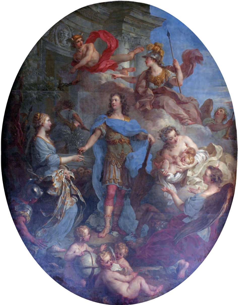
3 François Lemoyne (1688-1737), Louis XV donnant la paix à l'Europe - Louis XV offrant ses deux filles en témoignage de paix à l'Europe , Palace of Versailles, Salon de la Paix. The young sovereign, aged nineteen, holds out an olive branch and receives his twin daughters, Louise-Elizabeth and Anne-Henriette, from the hands of Fertility and Piety. In the background, Discord tries in vain to reopen the doors of the Janus temple.