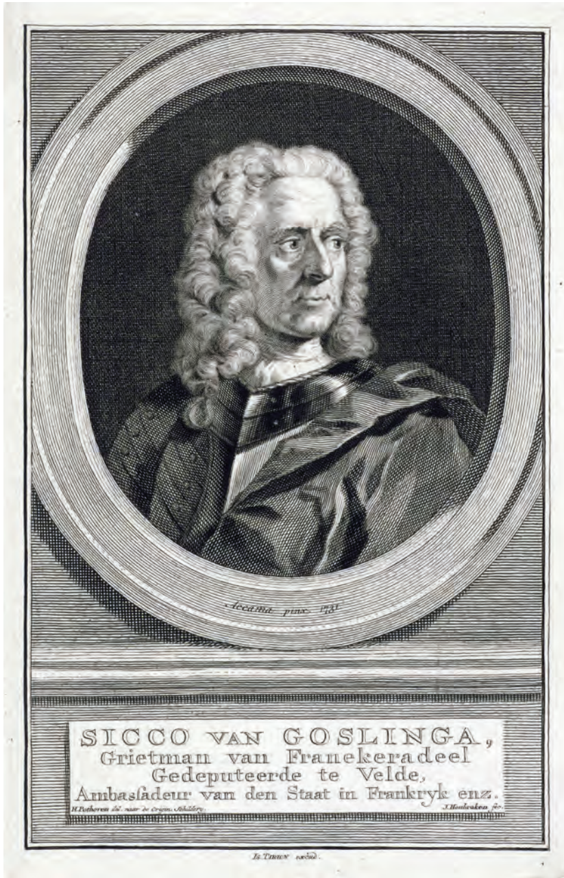
Sicco van Goslinga (1664-1731), Fries politicus en Nederlands diplomaat. By Jacob Houbraken (1698–1780) Naar tekening van: Hendrik Pothoven (1725-1807). Rijksmuseum, Amsterdam.