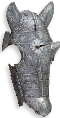
Testiera (Shaffron) per cavallo, Brescia (?) 1560-70 Metropolitan Museum of Arts, New York. Public Domain