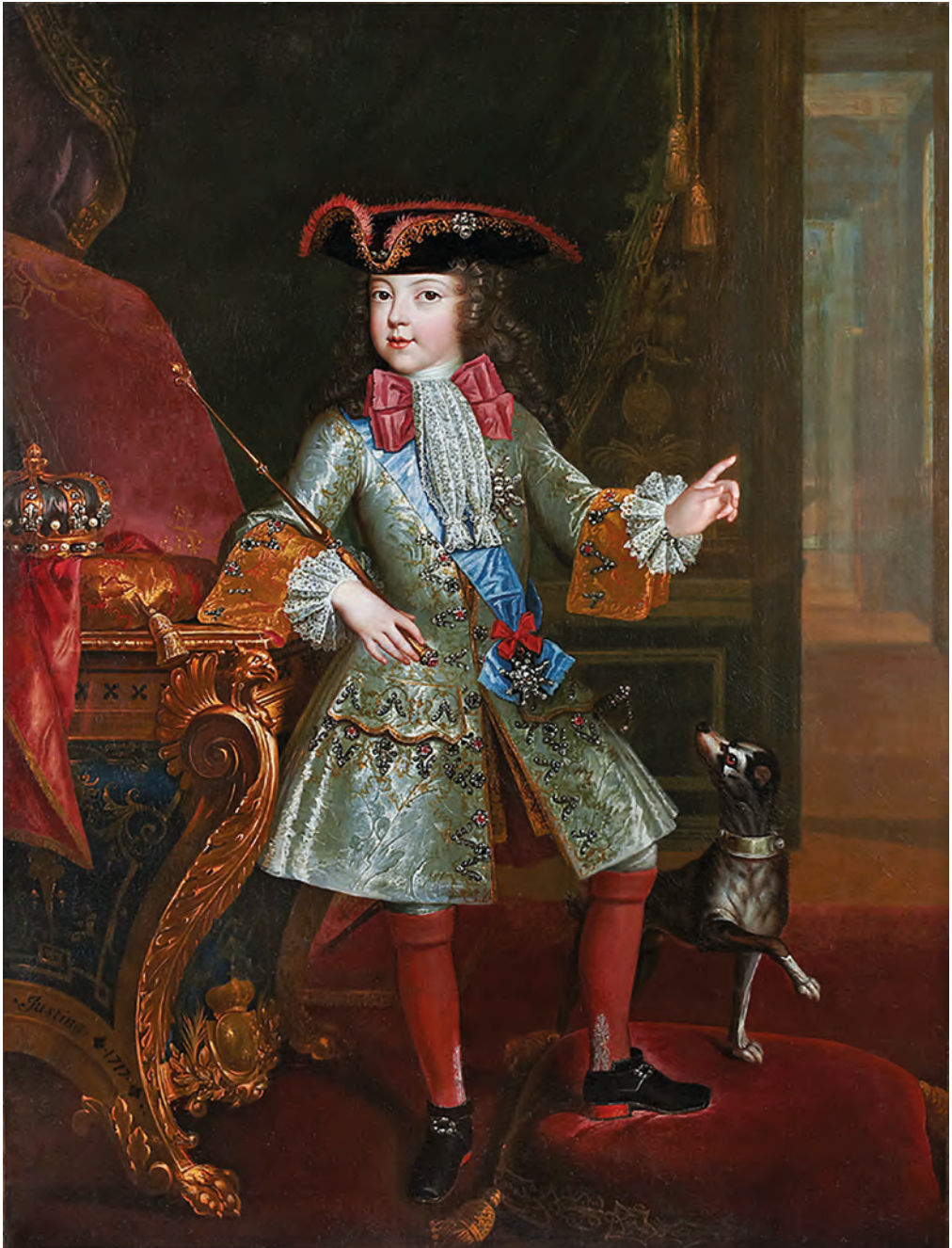
Augustin-Oudart Justinat (1663-1743), Portrait of Louis XV of France, National Museum in Warsaw