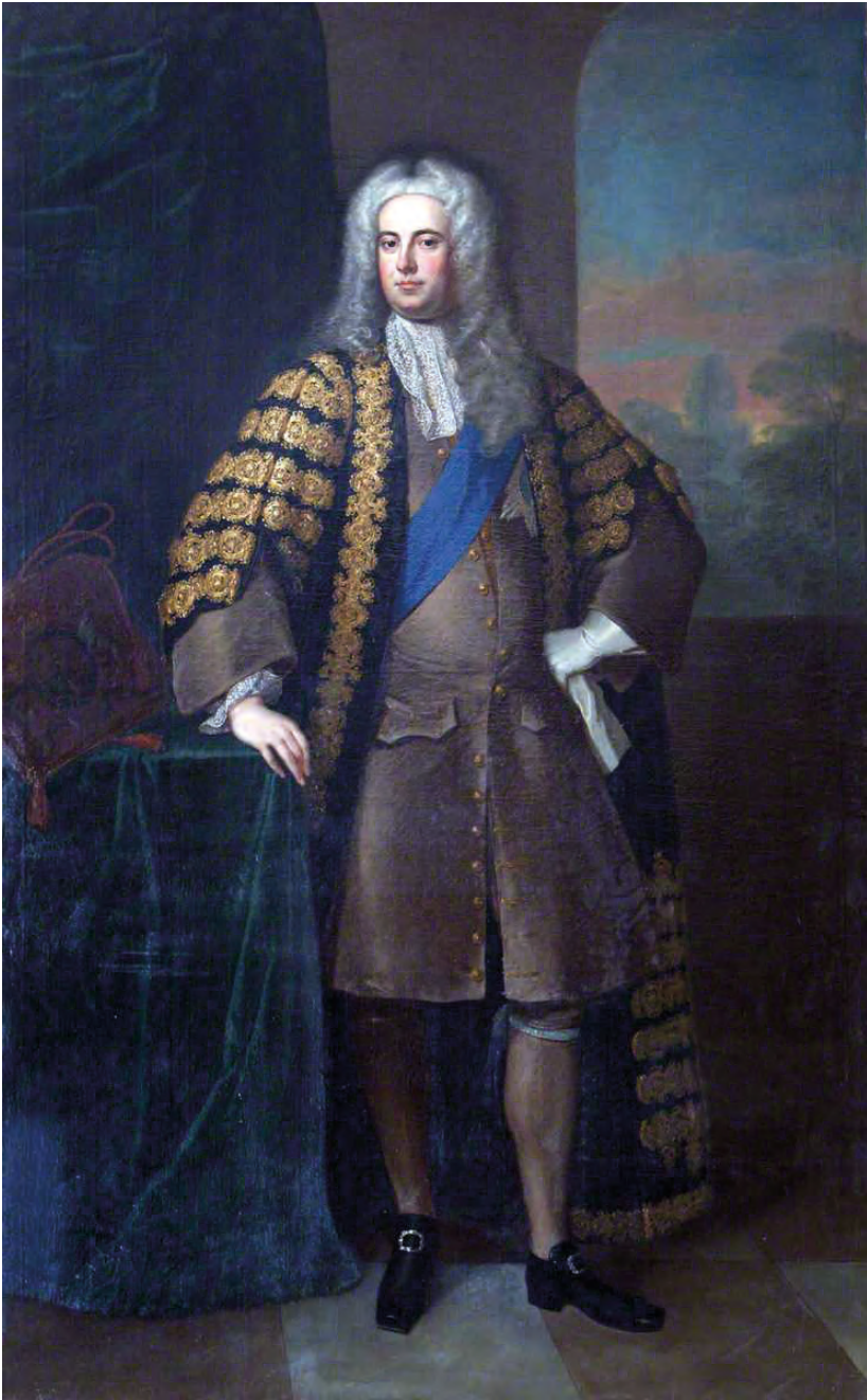
William Aikman (1682-1731), Portrait of Sir Robert Walpole, 1 st Earl of Oxford (1676-1745), Prime Minister , National Trust Collection ID 355487