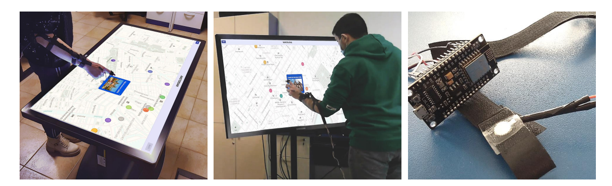
Fig. 1. Participants interacting with the horizontal (left) and vertical (middle) large displays. On the right, a close-up of the wearable device with vibration motors that we prototyped for our experiment.