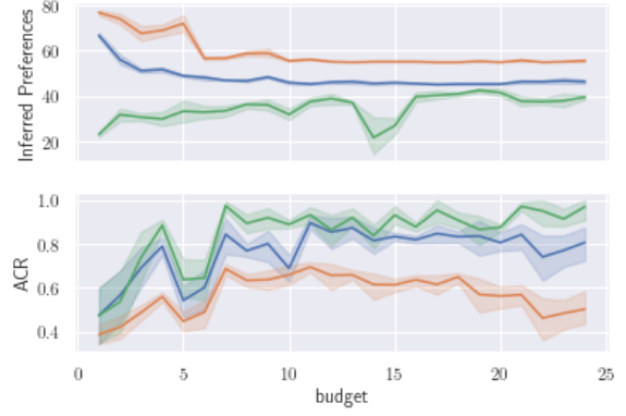
Figure 3: T (top) and ACR (bottom) with ORD (green), LPM (blue) and SVM (orange) for an unknown \theta and (\alpha, p, t) = (0.1, 0.9, 9) .