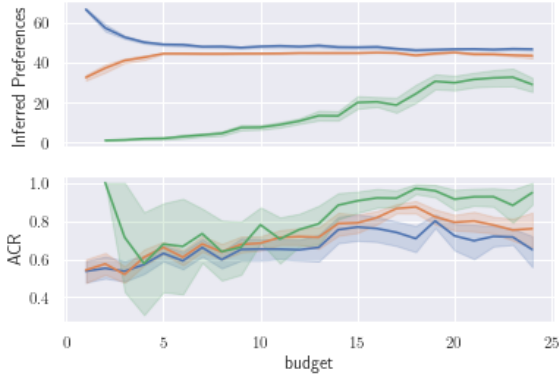
Figure 2: T (top) and ACR (bottom) with ORD (green), LPM (blue) and SVM (orange) for a known \theta and (\alpha, p, t) = (0.3, 0.7, 12) .