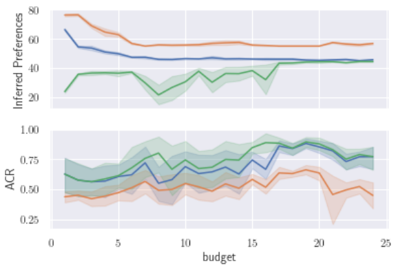
Figure 4: T (top) and ACR (bottom) with ORD (green), LPM (blue) and SVM (orange) for an unknown \theta and (\alpha, p, t) = (0.3, 0.7, 9) .

Experimental setting. The experimental setting is similar to the previous one, except that the number of categories in the tier lists is set to t = 9 . For all models (ORD, LPM and SVM), the set \theta is updated after each assignment of an alternative to a category, by using Algorithm 1.