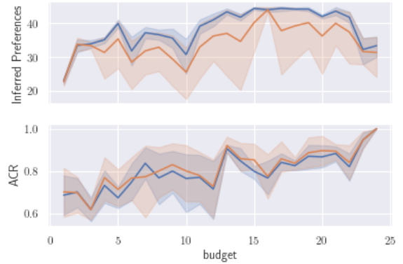
Figure 5: Number of inferred preferences and ACR with the real \theta (in orange) and with \theta_R^* (in blue), for (\alpha, p, t) = (0.3, 0.7, 9) .

We have presented here a “cautious” method for learning pairwise multiattribute preferences. The model we use is not restrictive, in the sense that any preference relation on the space of alternatives can be represented. The learning method