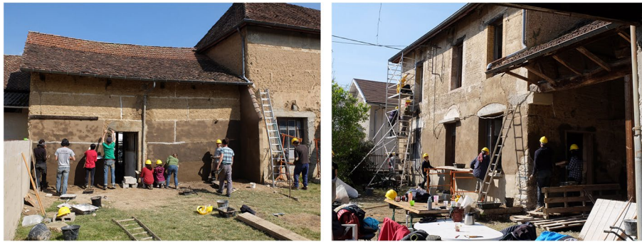
Fig. 4 Postgraduate conservation training for young professionals from 15 countries who came to Grenoble in 2021 to specialise in earthen architecture conservation