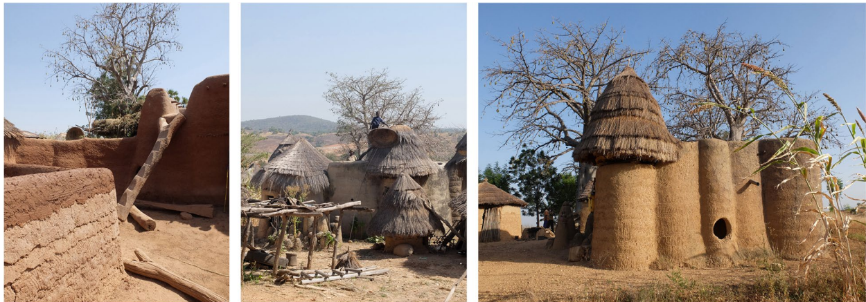
Fig. 1 Architecture of the Koutammakou cultural landscape, Benin

These aspirations for change are motivated by three main ideas: the rejection of archaic models, the desire to eliminate maintenance and the wish for a “modern” life in the image of globalised models.