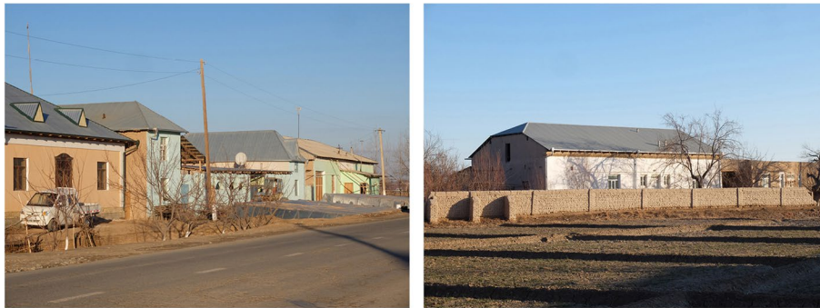
Fig. 2 Contemporary earthen houses in Uzbekistan