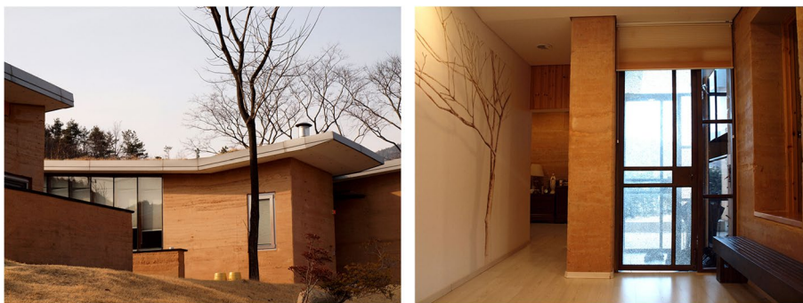
Fig. 3 Contemporary earthen houses in Korea, architect Yilwoo Lee

Several activist architects have supported the revival of vernacular architecture. While the work of Hassan Fathy serves as an historical reference (Fathy 1973), internationally renowned contemporary architects are also involved in such work. Such architects demonstrate that multiple strategies for the revival of vernacular earthen architecture are possible.