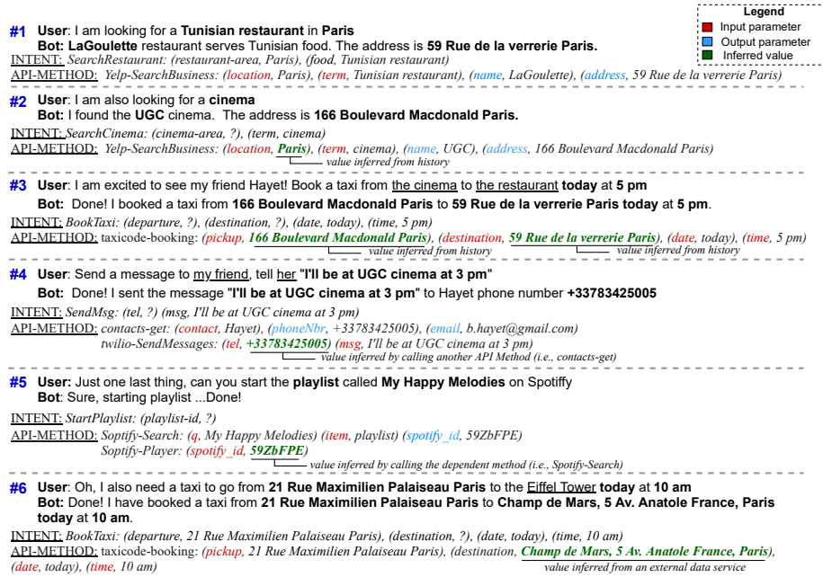
Fig. 1. Example of user-bot conversation where there are some complex intents.

Identify the dependent method to get a value of an id. The composite pattern called API-calls ordering allows mapping an intent to a sequence of API calls to satisfy order constraints. For example, in utterance #5, the user wants to start a playlist, but the value of the slot playlist_id is missing. In existing ST techniques, unless the bot developer implements an intermediate method that combines the two API methods Spotify-Search and Spotify-Player , the bot will ask the user for the value of the slot playlist_id . A bot improved with CKS will automatically map the user intent (i.e., StartPlaylist ) to a sequence of API calls to get the value of the id .