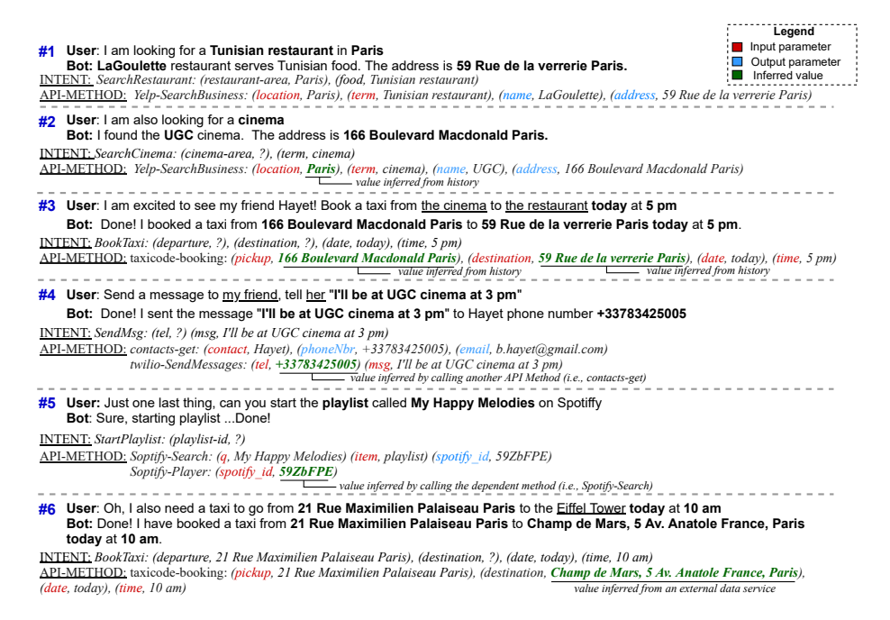
Fig. 1. Example of user-bot conversation where there are some complex intents.

Identify the dependent method to get a value of an id. The composite pattern called API-calls ordering allows mapping an intent to a sequence of API calls to satisfy order constraints. For example, in utterance #5, the user wants to start a playlist, but the value of the slot playlist_id is missing. In existing ST techniques, unless the bot developer implements an intermediate method that combines the two API methods Spotify-Search and Spotify-Player, the bot will ask the user for the value of the slot playlist_id. A bot improved with CKS will automatically map the user intent (i.e., StartPlaylist) to a sequence of API calls to get the value of the id.