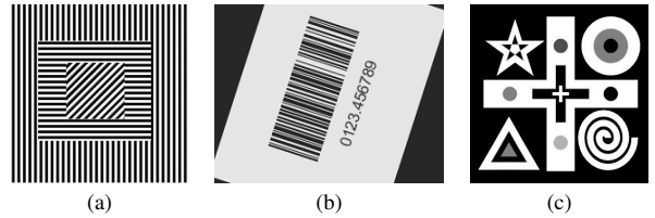
Fig. 1: Original images: texture (a), barcode (b), and geometric (c).

By applying again Moreau's formula, the proximity operator of \sigma h_3^* is given by