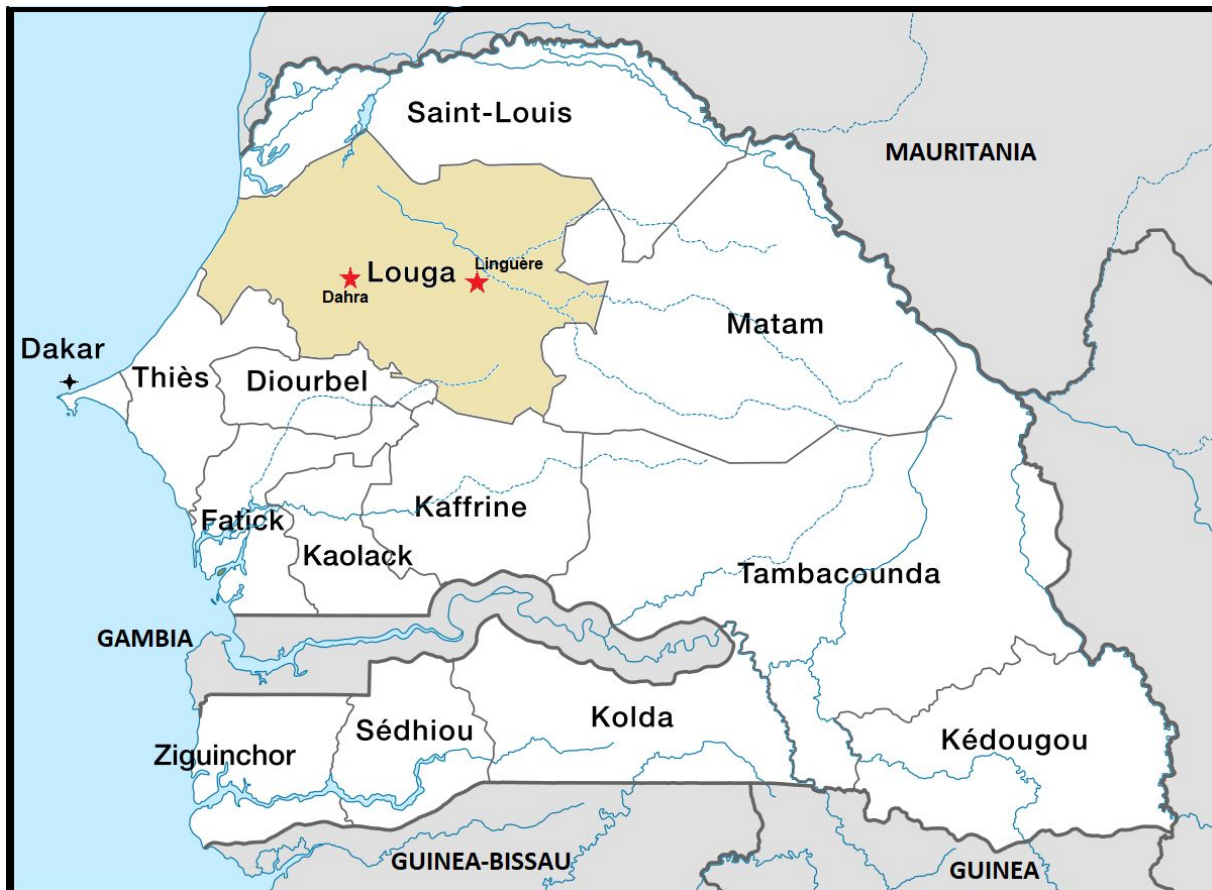
Appendix Figure 1: The Senegalese map showing the localities of Dahra and Linguère. The red stars in the map indicate the geographical position of the localities of Dahra and Linguère in the Louga region, Senegal.