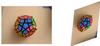
Figure 1. Example of affine original image A (left) and its affine transform A' (right).

This section compares the performances of the different distances defined in Section 3, when used for the matching of SIFT-like descriptors. These descriptors are obtained in a way similar to the original SIFT [4], except that they are extracted from circular masks divided in M = 9 subregions. In order to estimate the robustness of the distances to histogram quantization, each circular histogram is computed twice, first with N = 8 then with N = 12 .