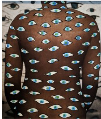
Fig. 6: Maria Magdalena Campos-Pons, The Right Protection , lithograph and paper pulp, 1999, URL: http://africandiasporaart.blogspot.com/2008/05/5292008_29.html (CC license permission)

Here again, the female artist's body is invested with remarkable symbolic power. Echoing Manuel Mendive's artistic path, Campos-Pons has designed a complementary, yet more introspective approach to the female Caribbean skin ego. Eyes with varying iris complexion are interspersed on a photograph of the artist's back skin: there are blue eyes, brown eyes, black eyes all over her body. So much so that the picture creates the impression that she finds herself surrounded, even immersed in a sea of eyes. But upon closer scrutiny, one will notice that the photographer reveals the political orientation of his art thanks to an astute device. In fact, Maria-Magdalena Campos-Pons has been placed in front of a wall painted with a mosaic of bigger eyes that look in her direction. Symbolically, the 'skin's eyes' are to be carried wherever she may go, a counter-narrative artifact that is reminiscent of the kind of hermeneutics developed in Toni Morrison's Bluest Eye .