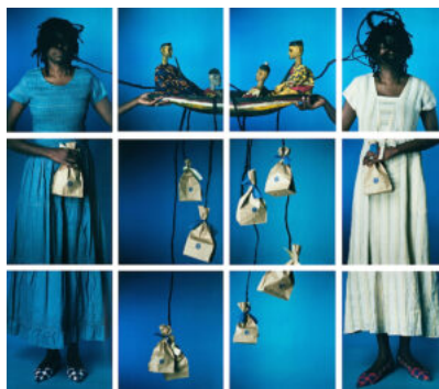
Fig. 8: Maria Magdalena Campos-Pons, De Las Dos Aguas , 2007 – 12 Polaroid Polacolor Pro, 20 x 24 in. – Photograph courtesy of the Harvey B. Grantt Center for African-American Arts.

The idea of inscribing the artist's body on a collective scroll of dermic memory plays a central part in the process of reconfiguration that can preserve and enrich the Caribbean artistic heritage. This stands for a glocal decolonial project proceeding from a re-appropriation of personal, mythological, and historical experiences [26] . The extension of this legacy to Pan-Caribbean communities bears witness to the fact that Foucault's conception of the body as "a text upon which social reality is inscribed" [27] is not a mere metaphor. Silences are broken, narratives are recombined and histories relocated on local and global levels [28] . All in all, remodeling memory is akin to performing some kind of social sculpture when art and history are called on the stage of memory rehearsal. The presented works constitute tangible evidence that dermic memory is real and can be best connected through trans-American and trans-Caribbean artistic networks, as long as the desire to touch, or apprehend this diasporic art, is fed on, while being freed from colonial grids.