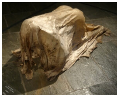
Fig. 4: Janine Antoni, Saddle , full rawhide , 27x32x79 inches (68.58 x 81.29 x 200.66 cm) © Janine Antoni, courtesy of the artist and Luhing Augustine, New York. Photograph shared under Creative

Saddle is a full raw cowhide draped over a mold of Antoni's body. When the material hardened, the mold was removed. Like a ghost, the cowhide holds the memory of the artist's body. When confronted with the object one feels the absence of both the artist and the cow. [19]