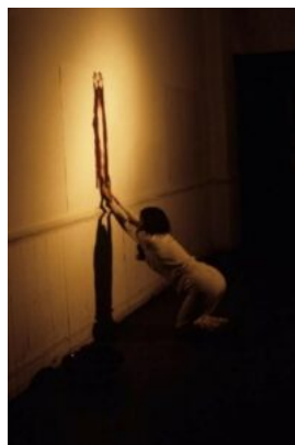
Fig. 5: Ana Mendieta, Siluetas , performance delivered on 4 Aug. 1982. Retrieved from https://library-artstor-org.bu-services.univ-antilles/fr/asset/AFURNACEIG_10310797082 (Creative Commons License authorization for republication).

Mendieta’s metaphysical relation to Itiba Cahubaba, the bleeding Mother-Earth of Taino cosmogony, coincides with the artist’s visceral connection to her native Cuba. It is worth mentioning that this deity plays a central role in empowering women. Interestingly enough, her influence spans from the Greater Antilles to the northern part of Guadeloupe. Rock art carvings from the Eastern Caribbean sites are scarce, but some were found on one of the river banks of Trois-Rivières. She is represented as a woman delivering a baby in the fluvial waters. Not only does she act benevolently towards mankind each time she presides over birth rituals, but she also guides women towards maturity and helps them to empower their womanhood in a male-dominated environment. Itiba Cahubaba/Yemaya/Mammy Wata is, from that standpoint, a progressive and inclusive archetype.