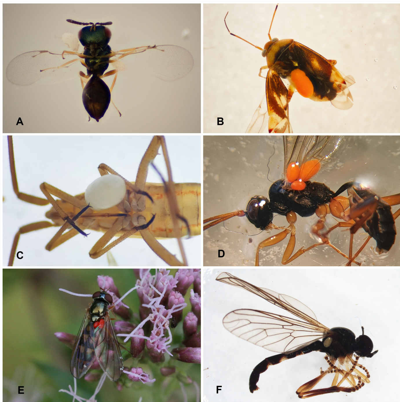
Figure 2 Trombidiid larvae (Parasitengona: Trombidiidae) parasitizing various hosts: A – Paratrombium egregium * on Pachyneuron groenlandicum (Hymenoptera: Pteromalidae); B – Trombidium holosericeum on Pinalitus visicola (Hemiptera: Miridae); C – T. holosericeum * on [?] Leptopterna dolabrata (Hemiptera: Miridae); D – T. holosericeum on Cryptinae sp. (Hymenoptera: Ichneumonidae); E – T. holosericeum * on Melanostoma scalare (Diptera: Syrphidae); F – T. holosericeum on Dioctria sp. (Diptera: Asilidae). Not to scale. *Larvae depigmented due to preservation in EtOH.