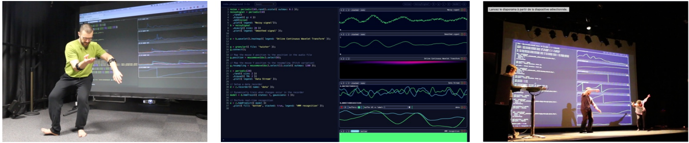
Figure 1: Dancers improvising with the live-coding environment CO/DA.