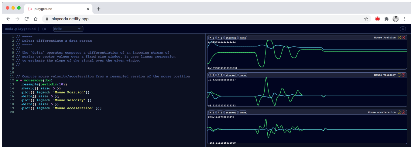
Figure 3: Screenshot of the CO/DA live coding environment. The left panel is a text editor enabling interactive execution. The right panel is used to display real-time visualizations.

Layering or combining mappings led us away from control towards indirection between movement and sound, fostering more engaging improvisations.