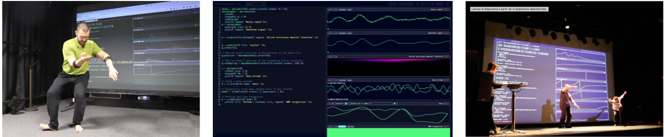
Figure 1: Dancers improvising with the live-coding environment CO/DA.