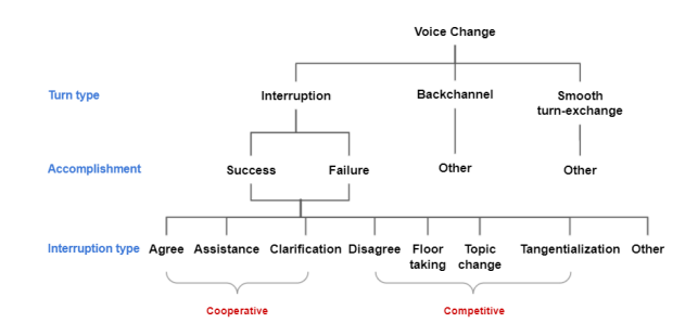
Figure 2: Interruption annotation schema

We manually annotated the interruptions for both IEMOCAP and NoXi databases with the annotation schema in Figure 2.