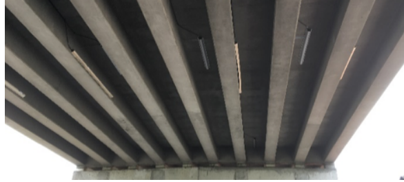
Figure 1: One main span of the bridge instrumented by optical strands

The methodology has been applied to assess the accuracy of a real bridge-WIM (BWIM) system currently operational on a road bridge over a highway in western France. The B-WIM system uses the bridge as the weighing system. It considers the measured deformation of the bridge due to the passage of the trucks. In our application, the bridge has four spans and the B-WIM strain sensors are installed on the two main spans, the length of which is 14.5 m. The bridge deck is of a type which is uncommon for B-WIM applications: ten parallel precast post-tensioned concrete beams support a concrete slab (see Figure (1)). Usually B-WIM solutions are used on short spanned concrete frames or slabs, or on orthotropic steel decks. Thus it was necessary to quantify the accuracy of the system in this unusual configuration. The B-WIM system tested is the “WIM+D” solution by OSMOS using optical strands (see Figure (1)), simultaneously considering WIM application and structural health monitoring [6].