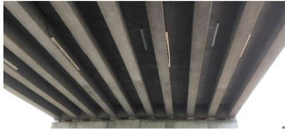
Figure 1: One main span of the bridge instrumented by optical strands

The methodology has been applied to assess the accuracy of a real bridge-WIM (BWIM) system currently operational on a road bridge over a highway in western France. The B-WIM system uses the bridge as the weighing system. It considers the measured deformation of the bridge due to the passage of the trucks. In our application, the bridge has four spans and the B-WIM strain sensors are installed on the two main spans, the length of which is 14.5 m. The bridge deck is of a type which is uncommon for B-WIM applications: ten parallel precast post-tensioned concrete beams support a concrete slab (see Figure (1)). Usually B-WIM solutions are used on short spanned concrete frames or slabs, or on orthotropic steel decks. Thus it was necessary to quantify the accuracy of the system in this unusual configuration. The B-WIM system tested is the “WIM+D” solution by OSMOS using optical strands (see Figure (1)), simultaneously considering WIM application and structural health monitoring [6].