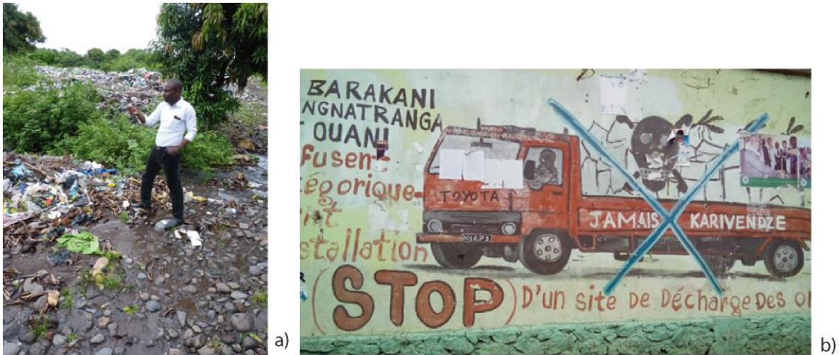
Figure 6: Photos of a) Lack of supervision of the “controlled” Domoni landfill (Source: Bahers, 2018) and b) protests to the siting of a dump in Ouani (Source: Bahers, 2018)