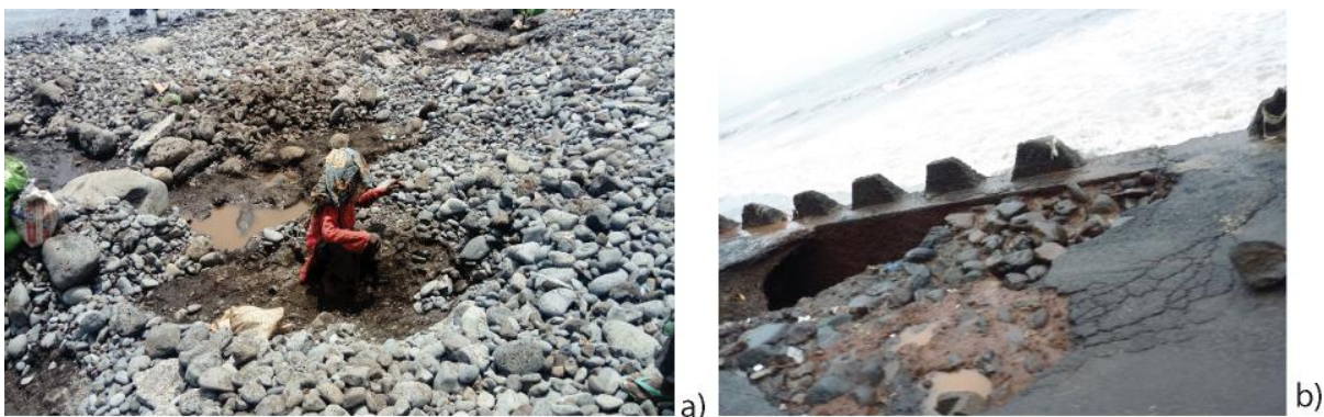
Figure4: Photos of a) informal worker collecting sand on the coast and a collapsed road at Mutsamudu

domestically produced materials are too expensive for many households. At the same time, the informal extraction of sand on the coast and rivers continues to be popular when possible, and accounted for about 20% of building material extraction on the island in 2016. Furthermore, this practice is very labor intensive (cf. Figure 4) and poorly paid: “I extract a quantity of thirty buckets per day. When I reach about 4m 3 , about a month’s work, I sell the sand for FRC50,000 [about €100]” (interview with worker extracting sand from the river at Ouani, 2018). It is also a disaster for the island’s landscape, because the coasts are progressively disappearing and undergoing major erosion as a result of this practice (Sinane et al. 2011). Furthermore, it endangers the road infrastructure along the coasts which sometimes collapse due to the receding beaches (cf. Figure 4).