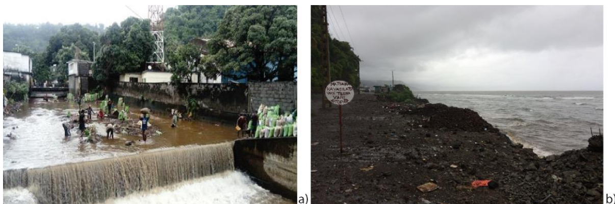
Figure1: Photos of a) extracting sand in a river and b) depositing of burnt waste along Mutsamudu beach next to a sign forbidding this placed there by local inhabitants