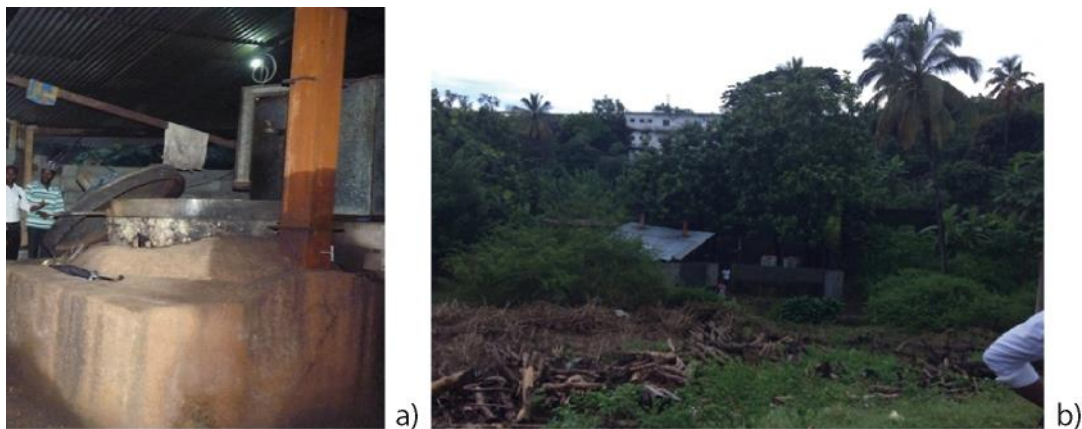
Figure 5: Photos of a) Ylang-ylang still and b) Distillation site with store of cut wood

causes of deforestation in Ndzuwani. About 1 ton of timber is consumed per distillation (cf. Figure 5), and “most of the time they get a logger to select and cut the tree, but don’t replant afterwards” (interview with NGO official, 2018). The wood is cut from natural forest and from agroforestry whose main species is Eucalyptus robusta , a colony plantation. The area of deteriorated forest is reported to have doubled between 1995 and 2014, from 8.3% to 15.3% of the land use (Boussougou et al. 2015) with logging of timber being as high as 260 kg per capita in 2016. This weakens the economic viability of the essential oil production sector, which is based on deforestation and therefore about increasing loss of forest, that leads to less domestic wood resources over time.