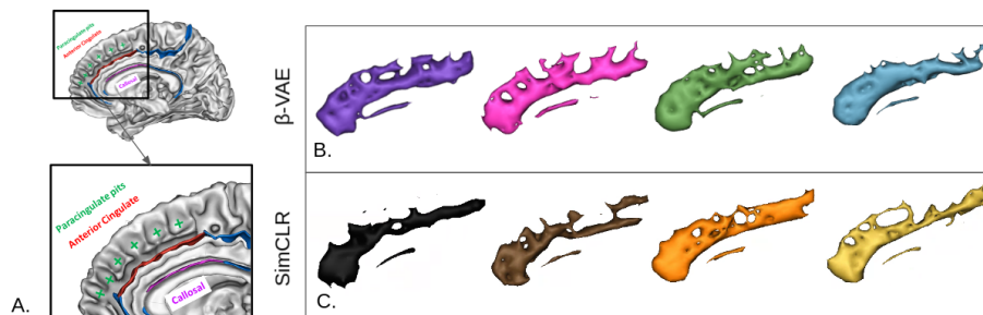
Fig. 3. Representative patterns as cluster averages. A) Description of typical folding structures in our ROI using the icbm152 average template. B), C) Local average sulci obtained for each cluster with \beta -VAE and SimCLR encodings respectively. Colors match cluster colors of Fig. 2.

to get rid of the too complex inter-individual variability and to focus on the main shapes.