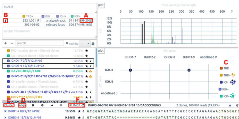
Fig. 4 Analyzing the clonotypes in the Vidjil client. Clonotypes are viewed at the same time in a Genescan-like view, a grid view (depending on V/J genes) and in a list. Moreover, the sequences of the selected clonotypes appear at the bottom