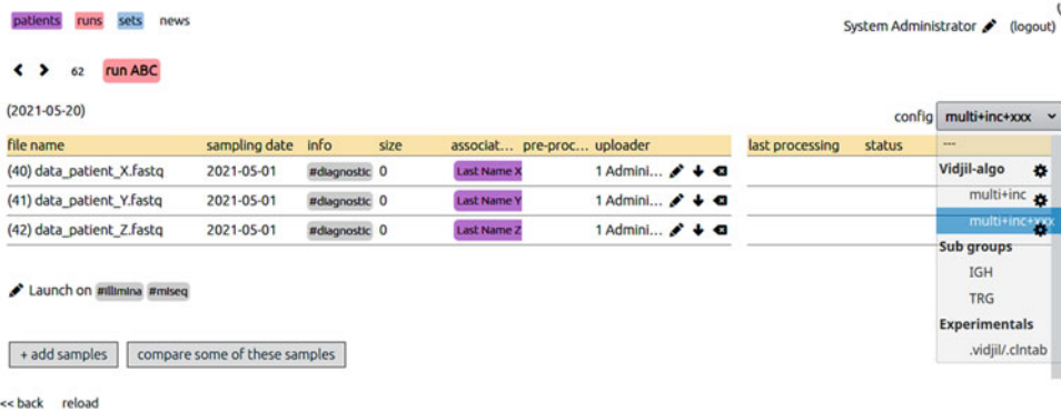
Fig. 3 Selecting configuration and launching Vidjil-algo processes