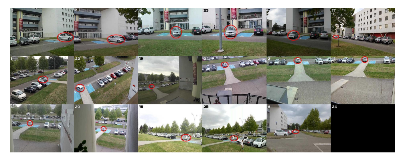
Figure 1: A subset of all the synchronized videos for a particular frame of the first scenario. First row: cameras located in front of the building. Second and third rows: cameras that face the car park. A car is circled in red to highlight the largely overlapping fields of view. When a frame is missing in a video, it is replaced with a black screen (camera 24).

Other datasets contain only audio files. The Freesound project [6] holds nearly 400 thousand of recordings updated by users with tags. Even if several datasets are hosted on Freesound [10, 15], most of the sounds are not annotated. The Urbansound dataset [15] is composed of 1302 audio files of complex field recordings that are temporally annotated.