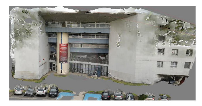
Figure 5: 3D reconstruction of the main building from the overlapping views using Structure-from-Motion [1].

3D and 4D reconstruction: the multiple cameras sharing overlapping fields of view along with some provided photographs of the scene allow to perform a 3D reconstruction of the static parts of the scene, see Figure 5, and to retrieve intrinsic parameters and poses of the cameras using a Structure-from-Motion algorithm [1]. Beyond a 3D reconstruction, the temporal synchronization of the videos could enable to render dynamic parts of the scene as well and to obtain a 4D reconstruction.