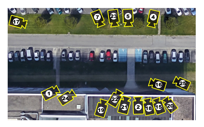
Figure 2: The main building which concentrates 17 cameras with overlapping fields of view. 8 other cameras are located out of this field of view, see Figure 3.

at the sight of the cameras with overlapping views). P gets off of C and enters the building. One minute later, a woman complains to D about his bad parking. C quickly goes away and stops in the field of view of the camera 8. Approximatively one minute later, P leaves the main building holding a packet, and runs away. P meets C a little further (in the field of view of the camera 8), gets in C, and C quickly leaves the university campus (passing in the fields of view of most cameras).