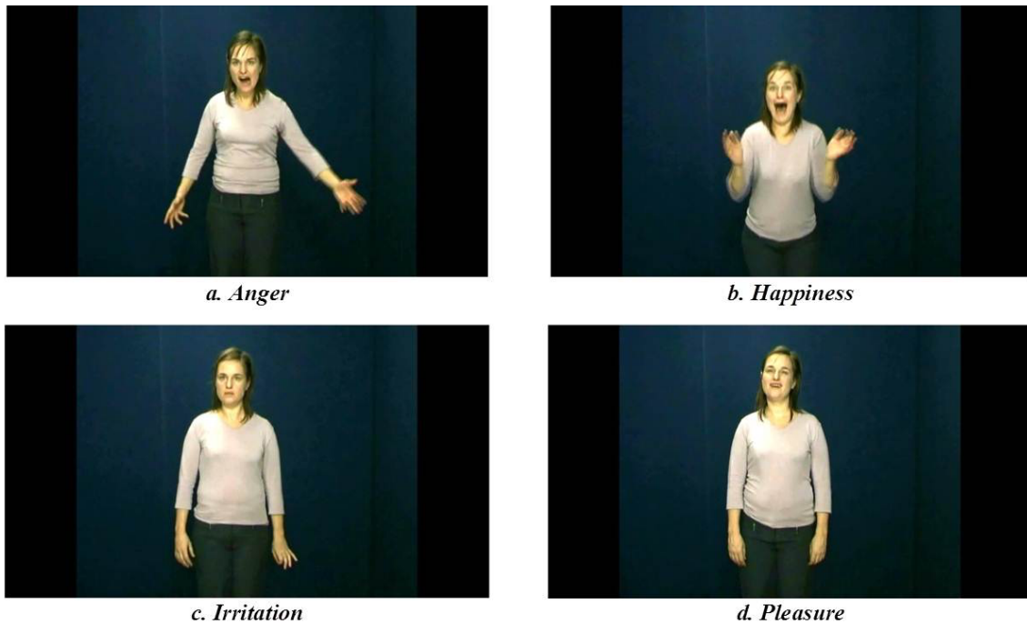
Figure 1. Photographs a, b, c, and d show one of the actors expressing one of the four emotions used in the experiment.