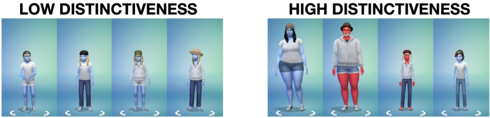
Photographs of the characters in a block in each distinctiveness condition.

1 2 3 4 5 6 7 8 9 10 11 12 13 14 15 16 17 18 19 20 21 22 23 24 25 26 27 28 29 30 31 32 33 34 35 36 37 38 39 40 41 42 43 44 45 46 47 48 49 50 51 52 53 54 55 56 57 58 59 60