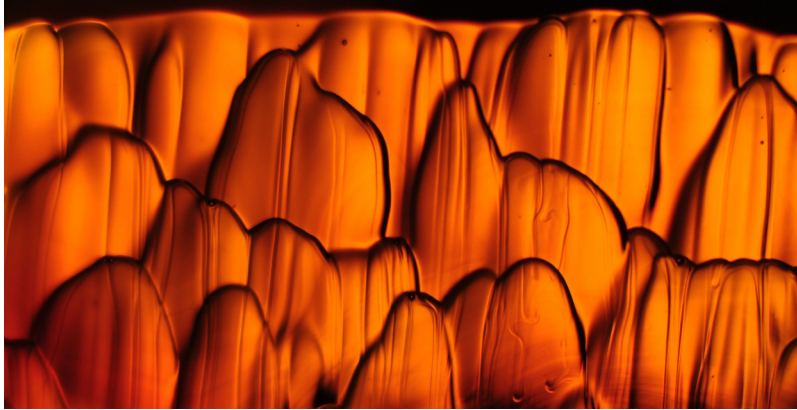
FIG. 1. Patterns observed underneath an inclined block of caramel dissolving in water. Black lines depict the sharp slopes of the holes and thin filaments witness the downward flow of dissolved caramel. DOI: http://dx.doi.org/10.1103/APS.DFD.2015.GFM.P0051

COHEN, BERHANU, DERR, AND COURRECH DU PONT